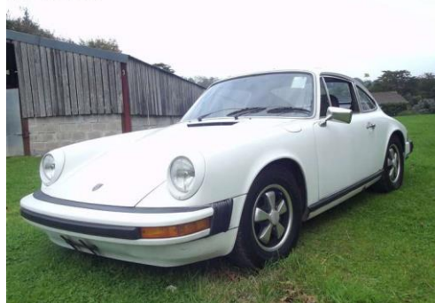
Lot No. 65

65 A 1976 left hand drive Porsche 912E, chassis number 9126001717, white. Porsche's 912E is one of the rarest Porsche models made, with only 2,099 manufactured to complement the 911S in the lucrative North American market. The 912E shared the 911S chassis and body styling but incorporated the 914 fuel injected 2 litre derived engine. This Porsche has recently been imported from the dry state of Arizona and was originally supplied by Alan Johnson Porsche on 30th June 1976 to its first registered keeper Dennis Forster & Son. This solid and rust free 912E has had a recent engine rebuild by Lloyd Mosher Enterprises Porsche and VW in California before being imported. The engine has been fitted with a twin Weber performance kit and the engine will need