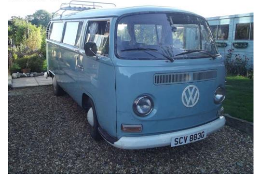
Lot No. 45

45 A 1969 Volkswagen T2 Combi, registration number SCV 883G, chassis number 239190234, blue. Volkswagen's second generation of camper was launched in 1967 and featured the new wrap around or bay window windscreen. It would remain in production until 1979. This example, an eight seater two berth model, was imported from South Africa in 2008. It is presented in an original condition. The current vendor has maintained the camper well, and there are receipts on file from marque specialists, including South West Classic VW amongst others. Now reluctantly for sale due to losing its garage space. V5C, MOT to September 2016 See illustrations