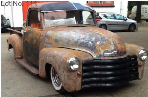
Lot No. 111

111 A 1951 left hand drive Chevrolet 3100 ratrod pickup, registration number WXG 216. This Chevy has recently been imported by the vendor from America. It is a little different as it is an original 1951 model which has been uprated with a 1999 S-10 chassis and running gear. The engine is a V6 Vortec 4300cc and this Chevy has