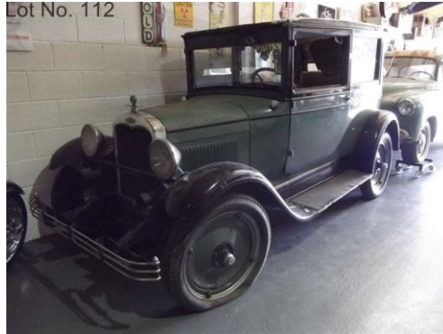
Lot No. 112

112 A 1968 Riley Elf Mk III automatic, registration number LMW 262F, two tone Almond green with white roof. This charming low mileage automatic example has covered a believed less than 32,000 miles from new. Originally supplied and retained by WT Wall, East Street Garage, Warminster until 2004 when the previous owner acquired her. The Elf was resprayed the original colour combination of Almond green with a white roof in 2010. The Elf still retains its original green leather interior and carpets. The Elf is offered for auction with past MOTs, owner's handbook and receipts. V5C, MOT to June 2016, tax exempt Sold for 3500