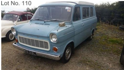
Lot No. 110

110 A 1972 Ford Transit Canterbury Conversion camper van, registration number MYD 318L, powder blue. This rare camper van was originally supplied by White's (Ford) Taunton, Somerset. It is fitted with some upgrades and accessories, including a stainless steel exhaust and is supplied with history for works carried out. ***The vendor informs us that the V5C will follow***, no MOT