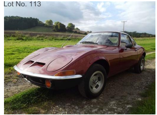
Lot No. 113

112 A 1968 Riley Elf Mk III automatic, registration number LMW 262F, two tone Almond green with white roof. This charming low mileage automatic example has covered a believed less than 32,000 miles from new. Originally supplied and retained by WT Wall, East Street Garage, Warminster until 2004 when the previous owner acquired her. The Elf was resprayed the original colour combination of Almond green with a white roof in 2010. The Elf still retains its original green leather interior and carpets. The Elf is offered for auction with past MOTs, owner's handbook and receipts. V5C, MOT to June 2016, tax exempt Sold for 3500